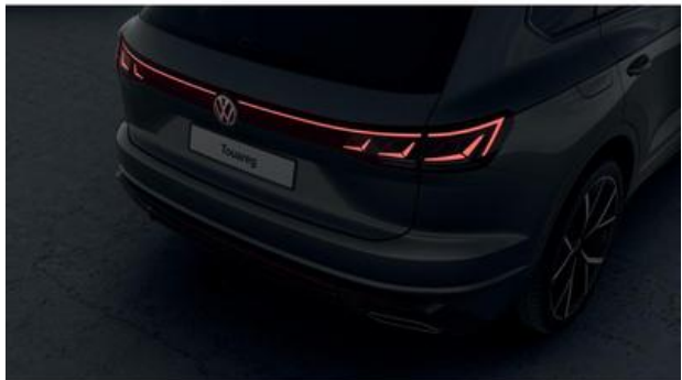
FESER ✕ GRAF