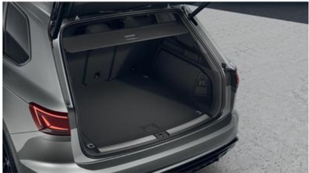
FESER ✕ GRAF