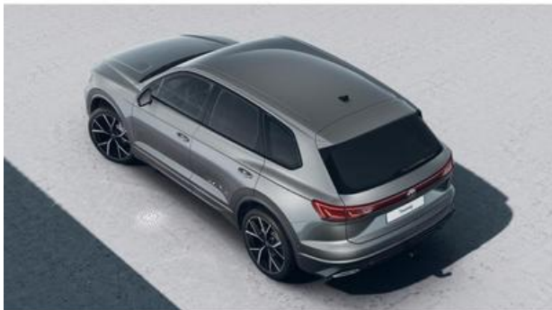
FESER ✕ GRAF