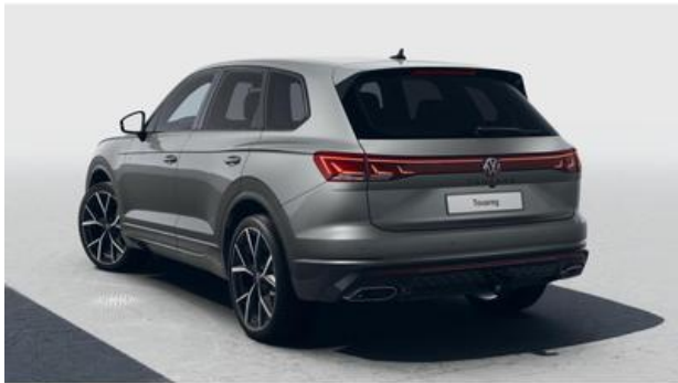
FESER ✕ GRAF