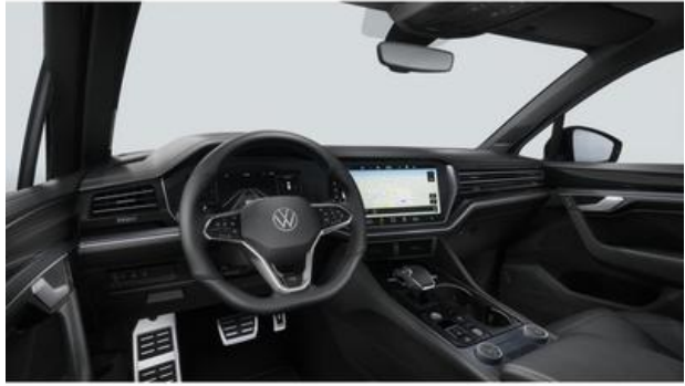
FESER ✕ GRAF