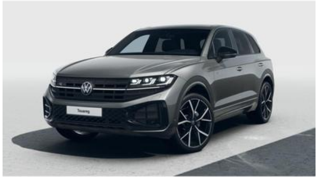
FESER ✕ GRAF