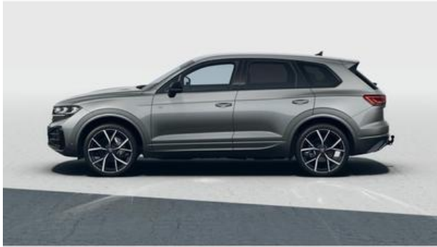
FESER ✕ GRAF