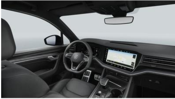
FESER ✕ GRAF