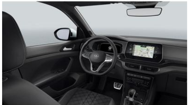
FESER ✕ GRAF