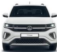
FESER ✕ GRAF