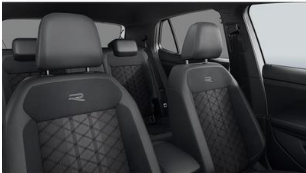
FESER ✕ GRAF