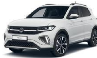
FESER ✕ GRAF