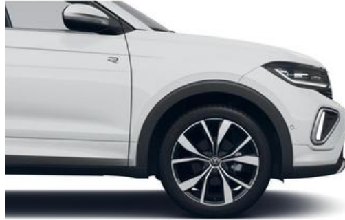
FESER ✕ GRAF