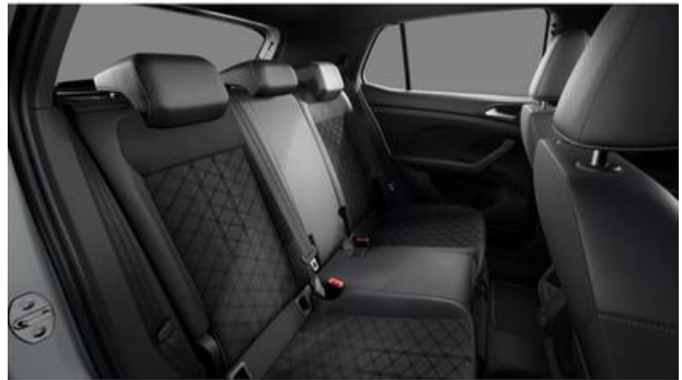
FESER ✕ GRAF