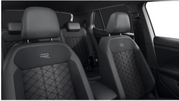
FESER ✕ GRAF