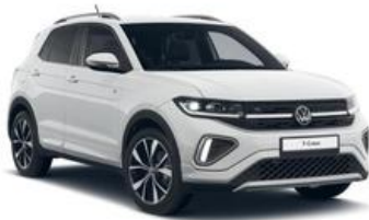
FESER ✕ GRAF